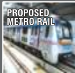
PROPOSED METRO RAIL