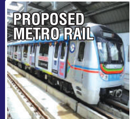
PROPOSED METRO RAIL